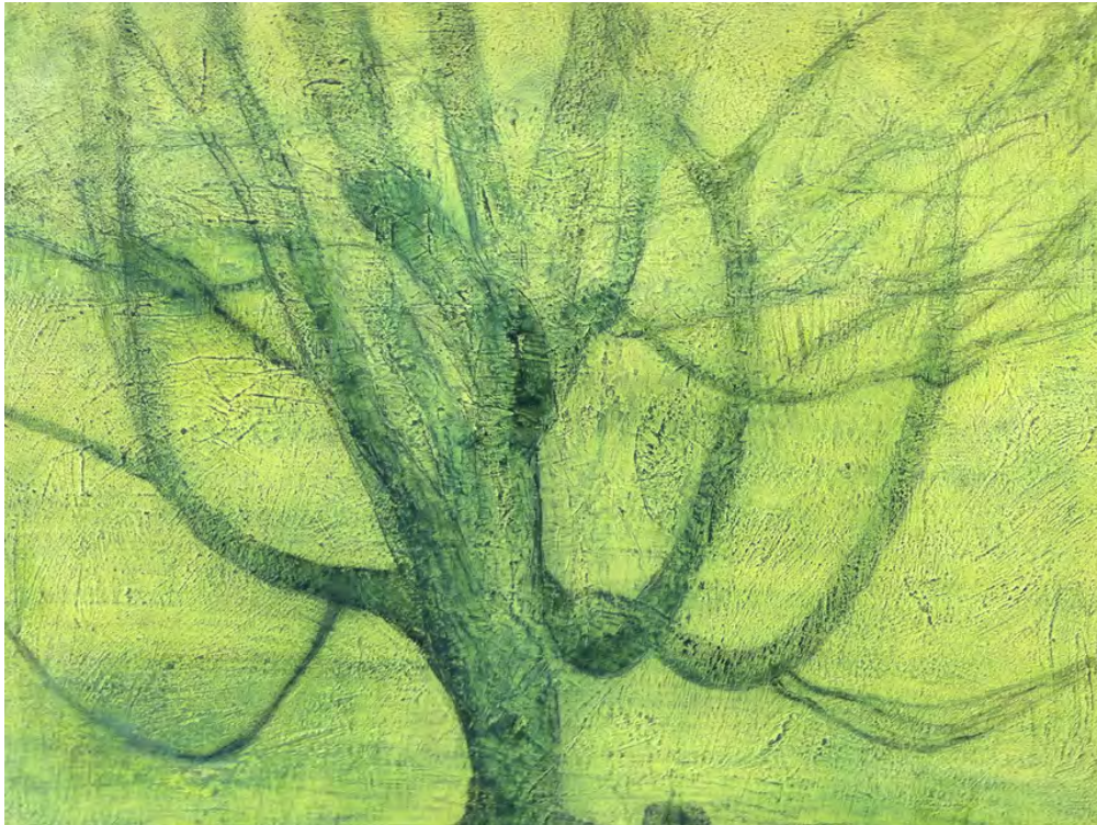
Deborah Freedman, Freedom of Worship 2, 2012, 3' x 4', Oil on Canvas

1–30 Apr 2015 at VanDeb Editions, United States